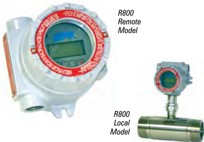
R800 Remote Model